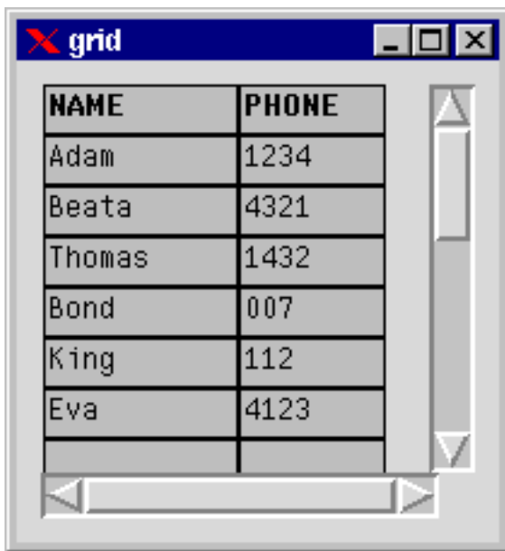
Figure 8.14: Simple Grid

The following simple example shows how to use the grid.